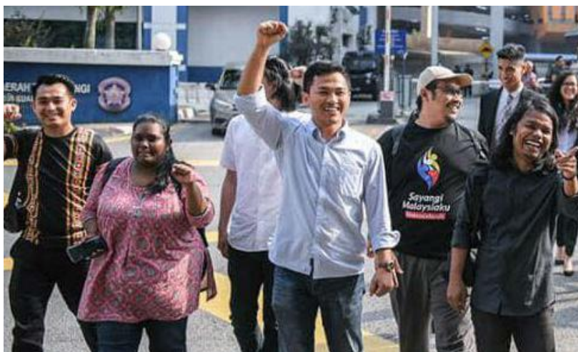
20 civil society activists investigated for potential violations of the Peaceful Assembly Act, 4 March 2020, Dang Wangi Police District Headquarters