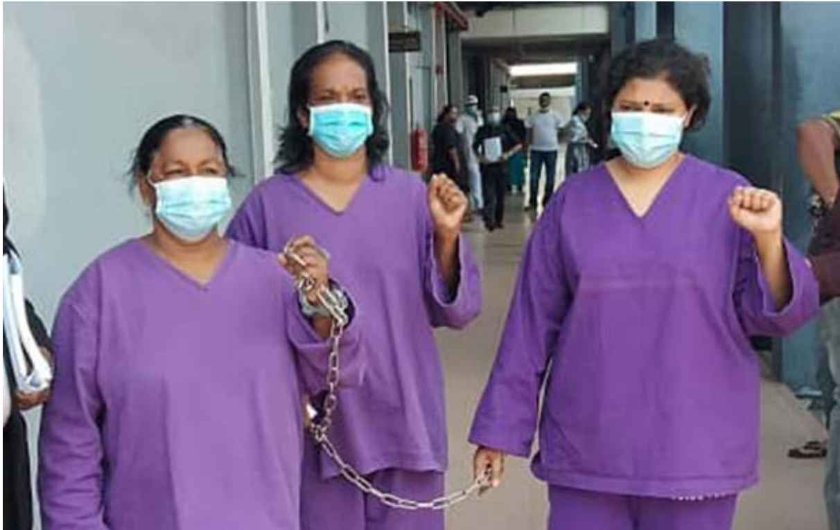
Remand hearing of unionists involved in protests, 3 June 2020, Ipoh, Magistrate Court

also pressured to undress in front of officers, threatened with a baton, and denied water and face masks while jailed. 81 Following advocacy and mobilisation from civil society organisations (CSOs), on 1 October 2020, the five protesters were granted a discharge not amounting to an acquittal. This was after the prosecution accepted the defence's representation not to proceed with the charges. 82