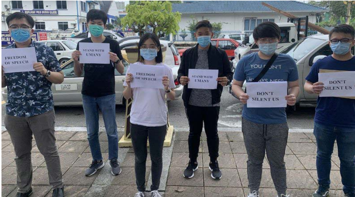
Two Umany students called for investigation under the Sedition Act by the police for publishing a Facebook post about the role of the king, 5 November 2020, Kajang Police District Headquarters.

The Sedition Act has been used extensively in recent years. According to the Home Affairs Minister, between 2015 and July 2020, 300 cases were opened under the Act. In these cases, 41 individuals were charged with violating the Act, 171 cases have been closed, and 34 cases were still pending as of July 2020. 11