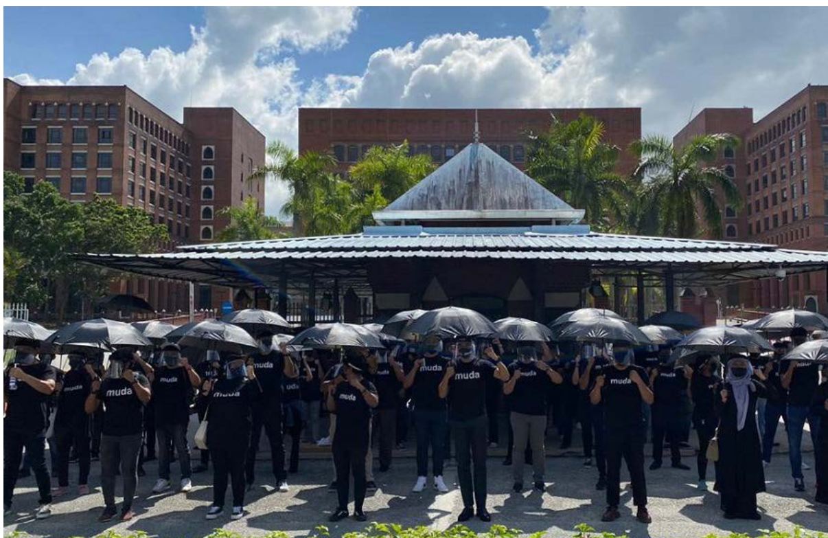
MUDA party members at Registrar of Societies, Putrajaya demanding registration. 21 December 2020, Putrajaya

The legal framework governing the operations of CSOs and political parties remains unduly restrictive and overly burdensome.