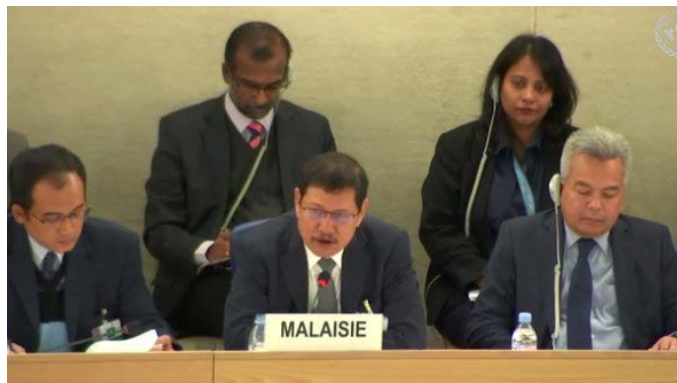
Malaysian delegation at Universal Periodic Review session in Geneva, Credit: UN Web TV

The Pakatan Harapan coalition campaign manifesto stated: “Suitable international conventions that are not yet ratified will be ratified as soon as possible, including the International Convention [sic] on Civil and Political Rights” (Promise 26). After coming to power, the Prime Minister and other senior government officials reiterated these commitments, including before the UN General Assembly in September 2018. 73 The Ministry of Foreign Affairs also held preliminary discussions in August 2018 about potential stakeholder meetings as a first step towards Malaysia’s ratification of international conventions.