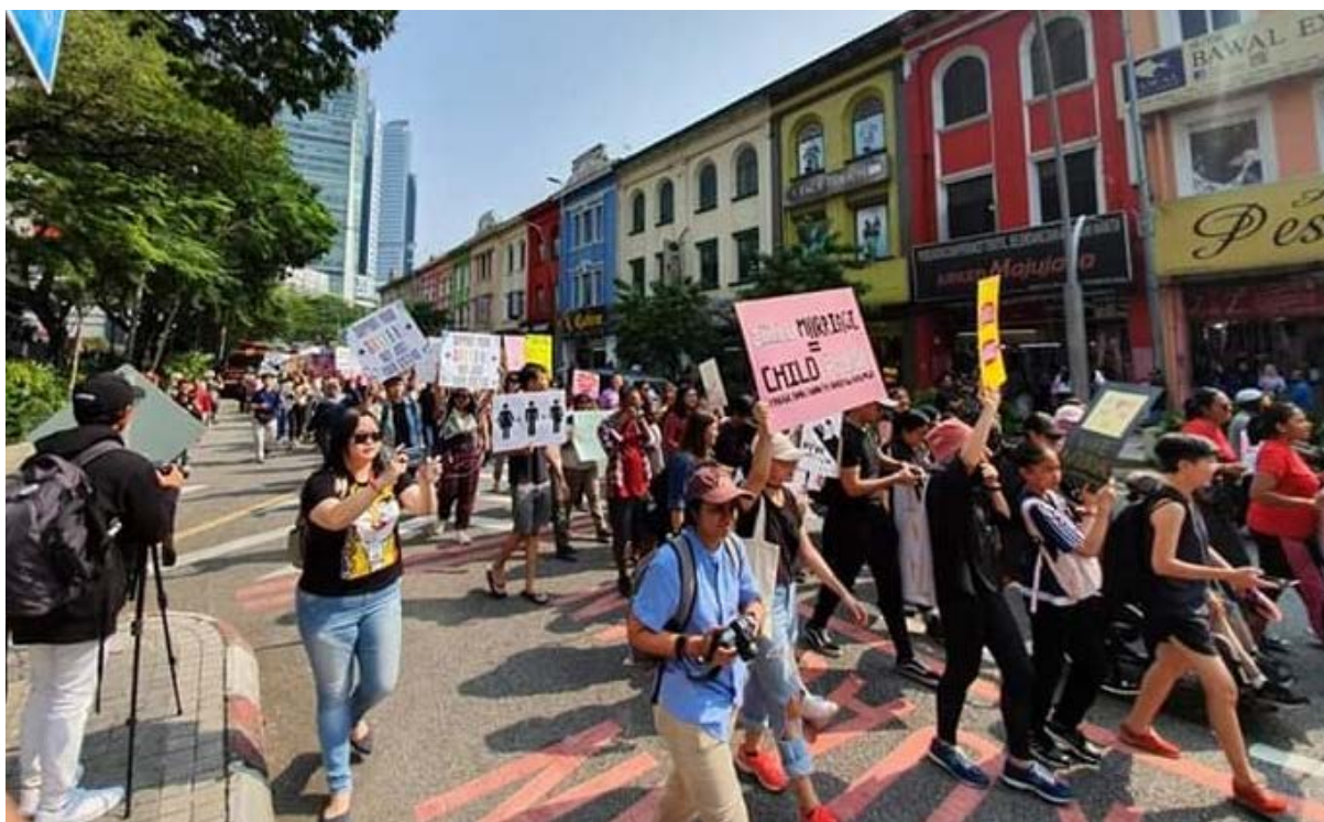
Women's day rally in Kuala Lumpur, March 2019.

the human rights of LGBT persons have been subjected to doxxing or dissemination of personal information or photos without their consent, hateful and violent messages and threats, and vilification and demonisation in the media. 68