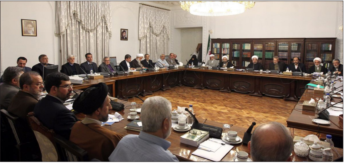
Image of May Meeting of the Supreme Council of the Cultural Revolution

A week prior to the election, during the 8 May 2017 'specialist council' of the 70th meeting of the Supreme Council of the Cultural Revolution (SCCR), a member of the Supreme Council of Cyberspace (SCC) was recorded discussing the development of "cultural guidance for mobile operators", including the opportunities and threats the availability of features such as video calls have brought. It is unclear whether the SCC's "culture guidance for mobile operators" will pass into law, but if the SCCR passes such a directive as a bill, the judiciary will have no other choice but to implement it as a law<sup>6</sup>. It is clear the purpose of such guidance is to have further control over freedom of expression and access to information on mobile connectivity. This is especially significant given that over half the number of Iranians connecting to the Internet do so over their mobile phones<sup>7</sup>.