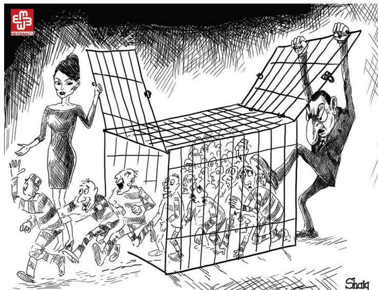
Caricature depicting President Aliyev and his wife's role in the arbitrary arrest and release of political prisoners

The same year, Azerbaijan was found to be the worst place for LGBTI people to live in Europe in 2016 by the European Region of the International Lesbian, Gay, Bisexual, Trans and Intersex Association (ILGA).