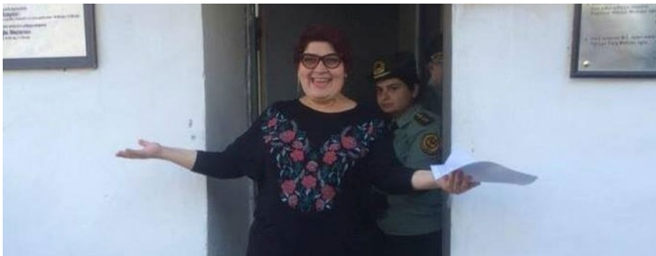
Khadija Ismayilova on the day of her release

Khadija Ismayilova's Defence Lawyer, March 2016.