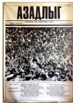
Front Page of Azadliq, 24/12/1989