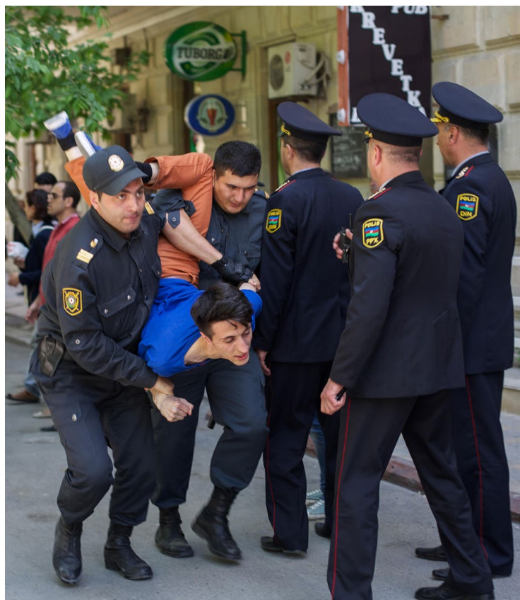
Youth Protestors are arrested in Baku, 2014

The authorities have also employed non-legislative means to intimidate and harass civil society, including through public smear campaigns in state-owned media (NGO staff and leaders are frequently labelled as traitors in popular press); intrusive stop and search processes against activists when entering or leaving the country; and applying pressure on private businesses not to provide services to civil society.