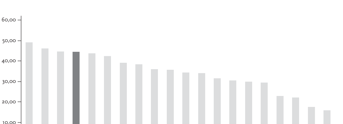
Figure 1.2 Public service television market shares (%) in selected European countries 2008

Source: Stępka, P., Woźniak, P., Murawska-Najmiec, E. (2010).